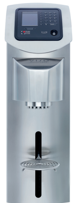
Vertically adjustable drip tray suitable for all standard cocktail glasses