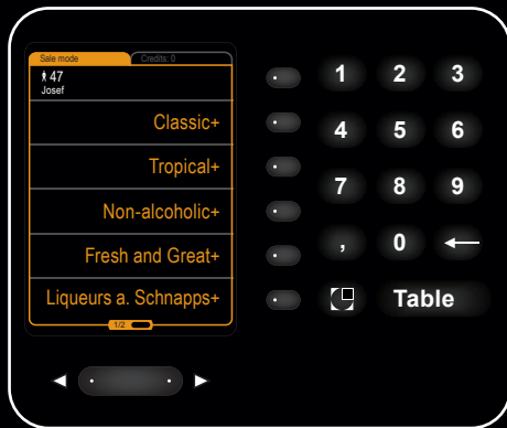
Main menu with various group keys