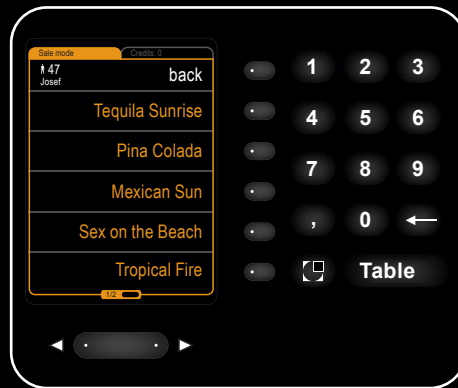
Cocktail selection – Tropical group key